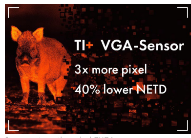
*in comparison with standard QVGA sensors

The new TI+ models are equipped with latest generation high-resolution 12\mu m VGA sensors. 3x more pixels* and 40% more sensitivity* (NETD <20 mK) produce a high-contrast image with unsurpassed detail recognition.